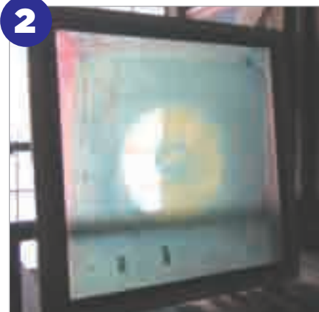
Silkscreen is built for the printing process.