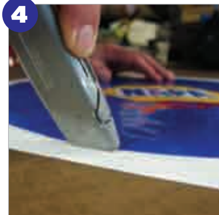
Next, the screen-printed vinyl is cut to size to fit the top of the stool seat.