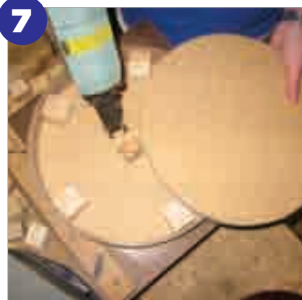
The cut wood components are then attached together to build a complete wood seat.