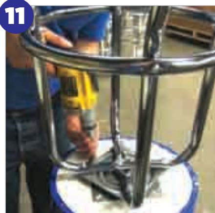
Then, the upholstered seat is attached to the frame to make a finished bar stool.