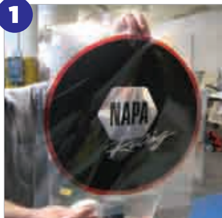
The film is created to burn a screen.