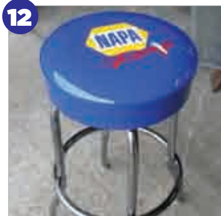
The finished bar stool is ready to be packed and shipped.