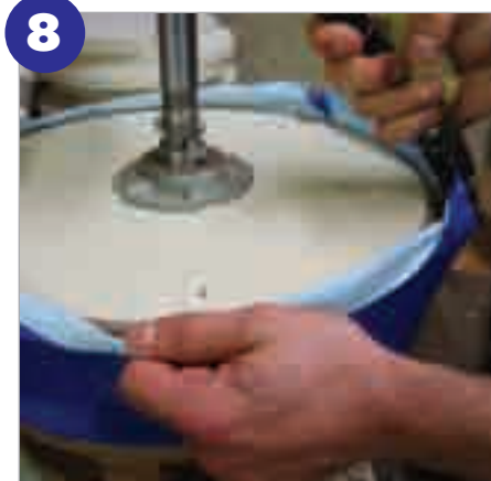
Foam is put in place and material is hand-stretched over the wood seat and foam.