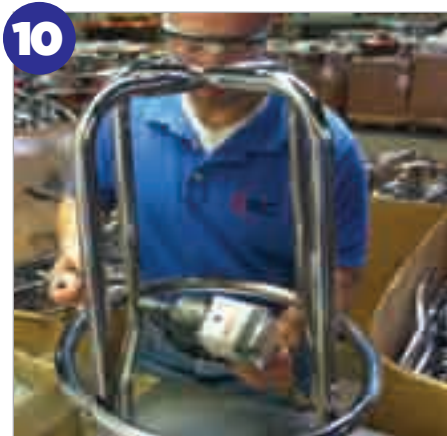
The steel frame components are assembled.