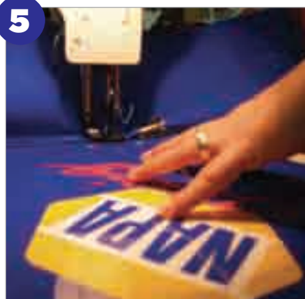
The top and side pieces of cut vinyl are sewn together.